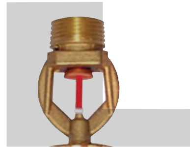
QUICK RESPONSE PENDENT