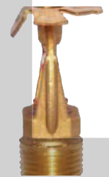
QUICK RESPONSE VERTICAL SIDEWALL