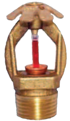
QUICK RESPONSE CONVENTIONAL