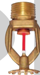
QUICK RESPONSE PENDENT