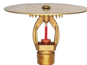
QUICK RESPONSE UPRIGHT

The heart of Globe's GL Series sprinkler proven actuating assembly is a hermetically sealed frangible glass ampule that contains a precisely measured amount of fluid. When heat is absorbed, the liquid within the bulb expands increasing the internal pressure. At the prescribed temperature the internal pressure within the ampule exceeds the strength of the glass causing the glass to shatter. This results in water discharge which is distributed in an approved pattern depending upon the deflector style used.