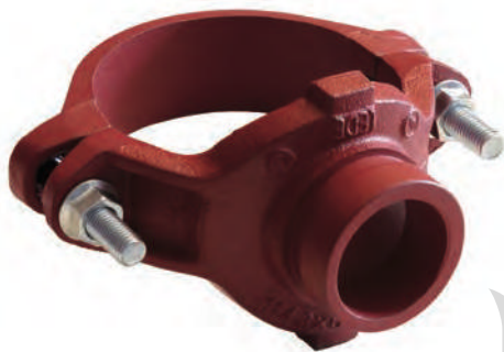
Grooved mechanical tee GMG