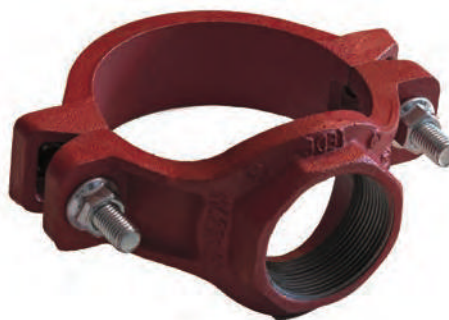
Threaded mechanical tee(BSPT) GMD