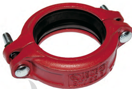
RIGID COUPLING GKS