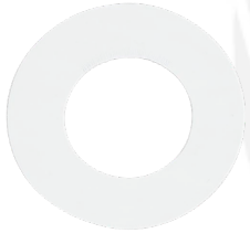
Table A: Extender Ring Compatibility